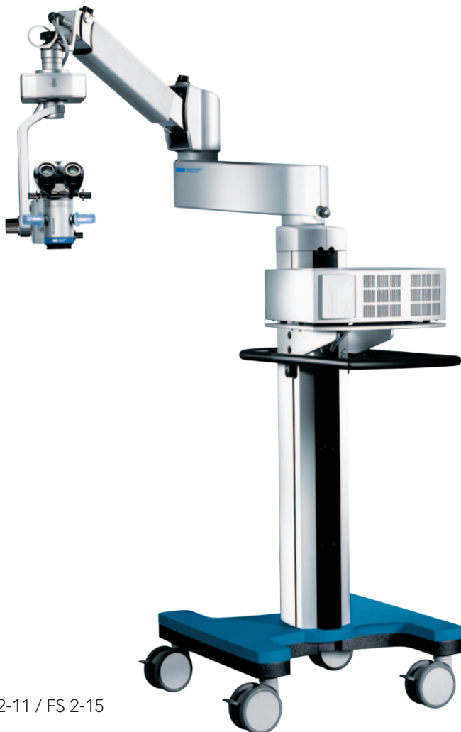
HS ALLEGRA 900 on floor stand FS 2-11 / FS 2-15