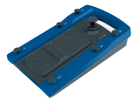
Foot switches EF 5000 and EF 5001 with 14 functions