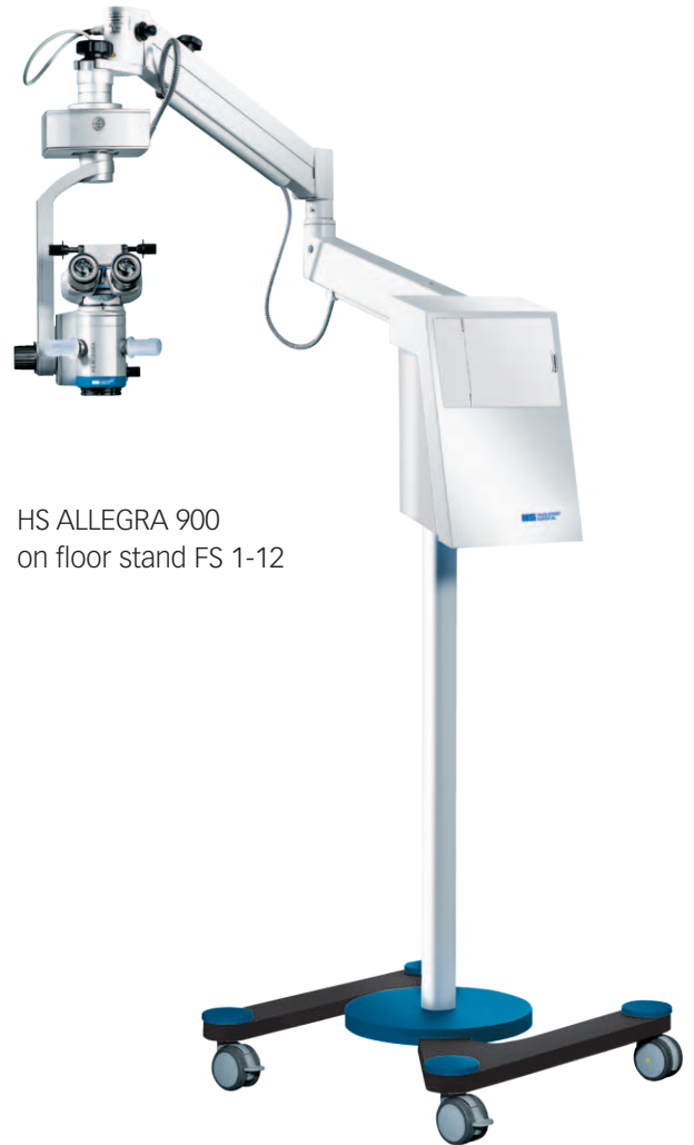
HS ALLEGRA 900 on floor stand FS 1-12

The newly designed foot switches EF 5000 and EF 5001 are recommended for hands-free control of the microscope functions. While EF 5000 is connected to the floor stand via cable, EF 5001 controls 14 functions of the microscope wireless via Bluetooth.